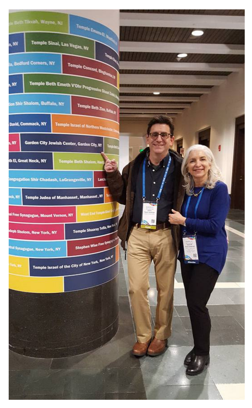
Attending the Union for Reform Judaism Biennial in Boston, December 2017.