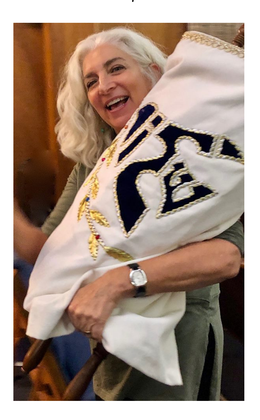
Simchat Torah, October 2017